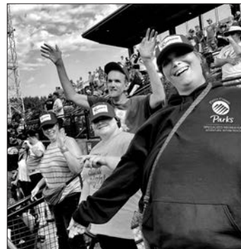
Cover: 2023 Tacoma Rainiers Game!